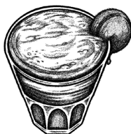
MOZE BEL LABAN

Our take on limeade, the Limonata is made with fresh limes, water, mint and condensed milk. It is guaranteed to be the best citrus drink you've ever had.