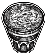
CARROT & CREAM

The Beet It Up is an earthy drink that releases dopamine, immediately making you feel really good. It is made with rich ingredients including beets, carrots, and ginger.